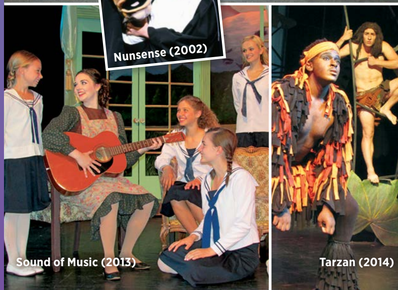
Sound of Music (2013)