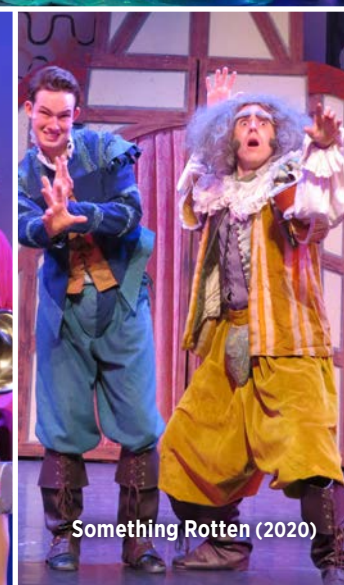
Something Rotten (2020)