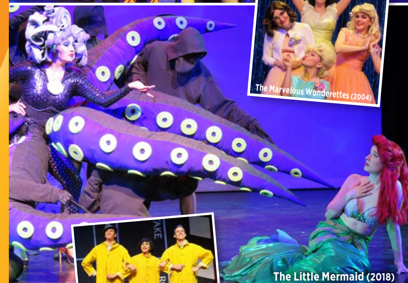
The Marvelous Wonderettes (2004)